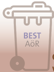
Organic waste bin

COMPOSTABLE WASTE GOES IN THE BROWN ORGANIC WASTE BIN (IF YOU DO NOT MAKE YOUR OWN COMPOST).